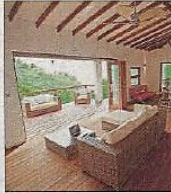
£598,000; above and below, a two-bedroom villa at White Turtle, Marigot Bay, on the west coast