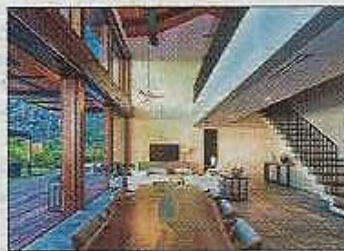
From £6.5 million: super-luxurious homes in the Beachfront Collection at Viceroy's Sugar Beach resort, St Lucia

your arm and someone will bring breakfast, if you can't summon up the energy to cross the landscaped lawns past fountains to the nearby colonial mansion. And if you fall in love with the rainforest spa treatments or the Cane bar for cocktails and catch terminal laziness, unable to leave the floaty, white voile curtains or the soft linen sheets of this beachside resort, you can buy a super-luxe home here.